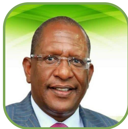
MR. KERIAKO TOBIKO, CBS, SC

Principal Secretary, Ministry of Environment and Forestry