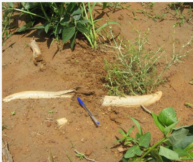
Suckering of Faidherbia albida