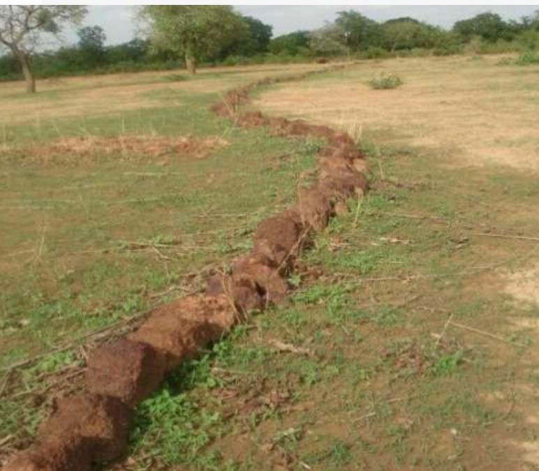
Stone bunds.

Producers can take advantage of plots with existing water and soil conservation structures, including earthen bunds, stone barriers, grass strips, e.t.c.). Such environments encourage natural regeneration for many forest species.