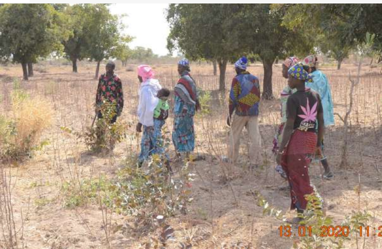
1. Examine your field and identify the number of tree species