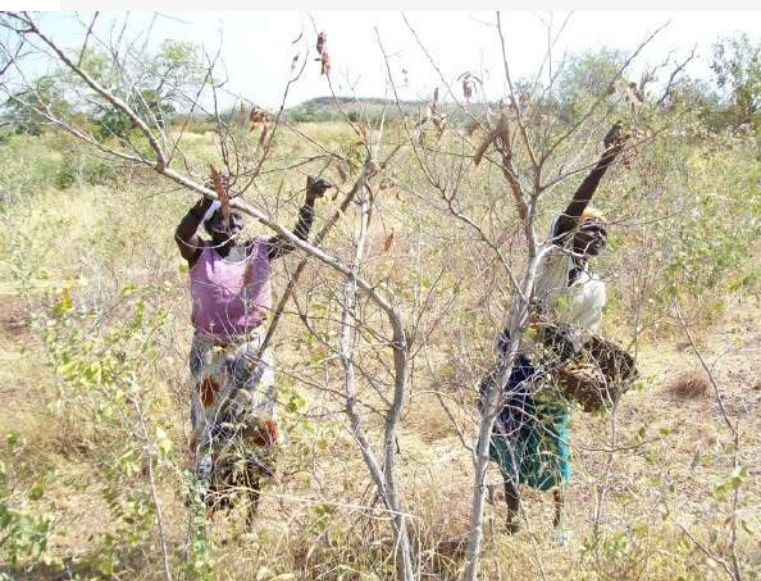
Collecting fruit from a Sahel shrub.