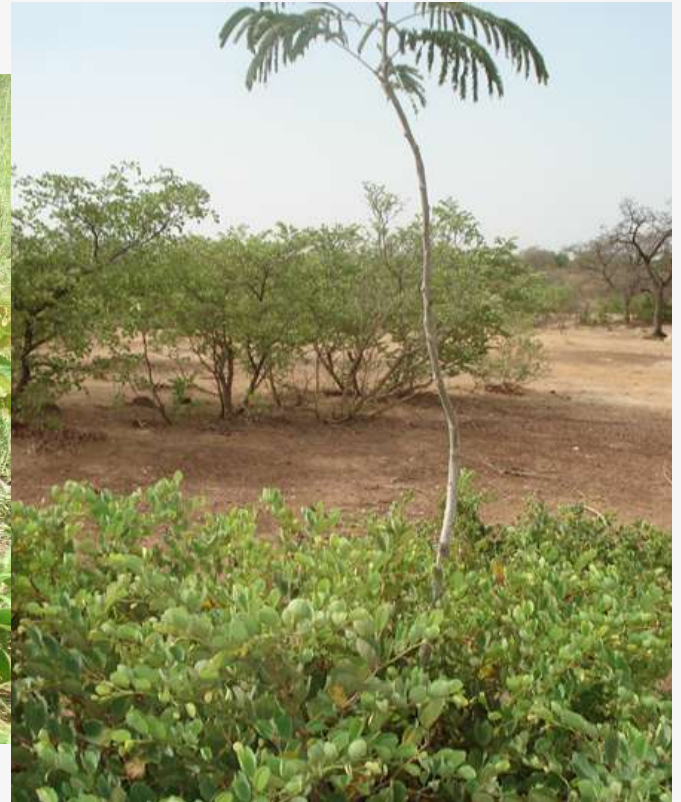
Nere plant.

Knowing how to exploit the ability of species to propagate vegetatively is key and this can be achieved through layering on the ground or suckering.