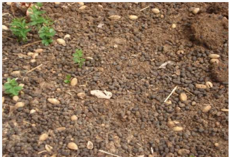
Manure put around Balanites seedlings.

Fruit seeds consumed in households by humans or animals can be found in organic manure. These seeds, mainly from agroforestry species, can then germinate deliberately in the fields as a result of the application of manure (e.g. baobab and balanites). The producer can also take the opportunity to add desired seeds, which will promote biodiversity.