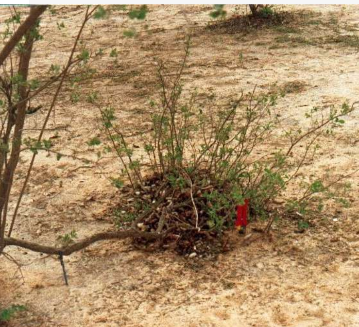
Marcottage of Guiera senegalensis

Knowing how to exploit the ability of species to propagate vegetatively is key and this can be achieved through layering on the ground or suckering.