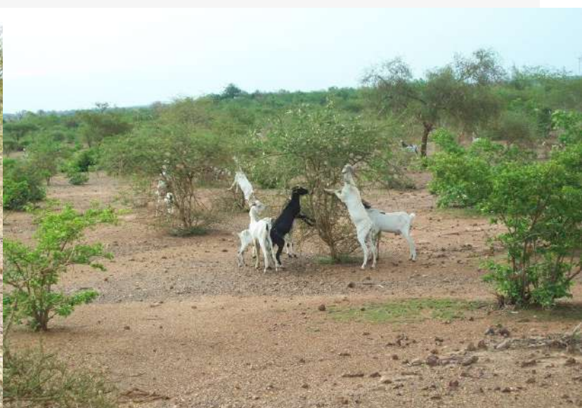
Goat grazing on leaves of Sahel shrubs.