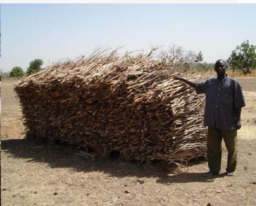
Collected firewood from trees and shrubs.