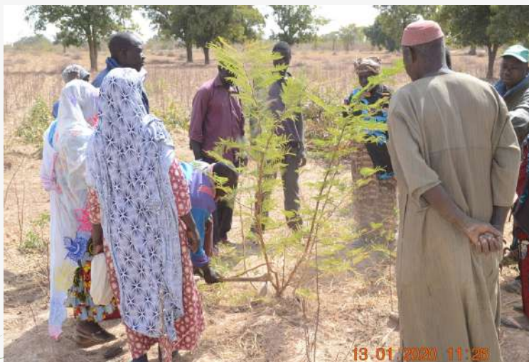
3. Select 2 or 3 good stems and eliminate the rest