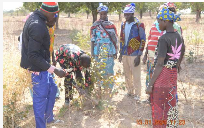
2. Identify the species to regenerate