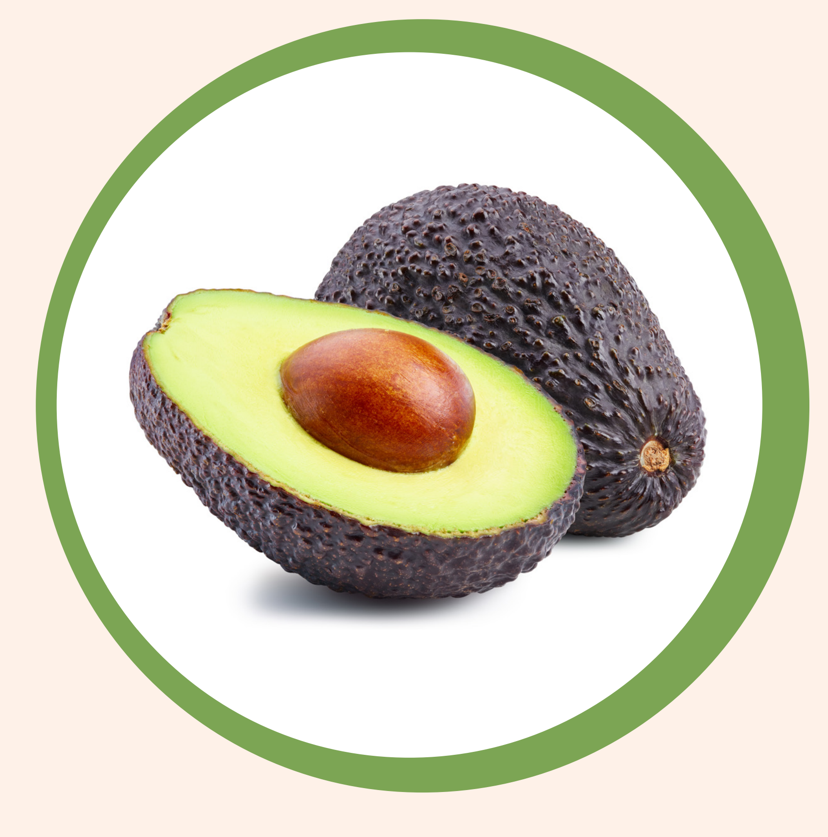
Avocado fruit, Avocado oil