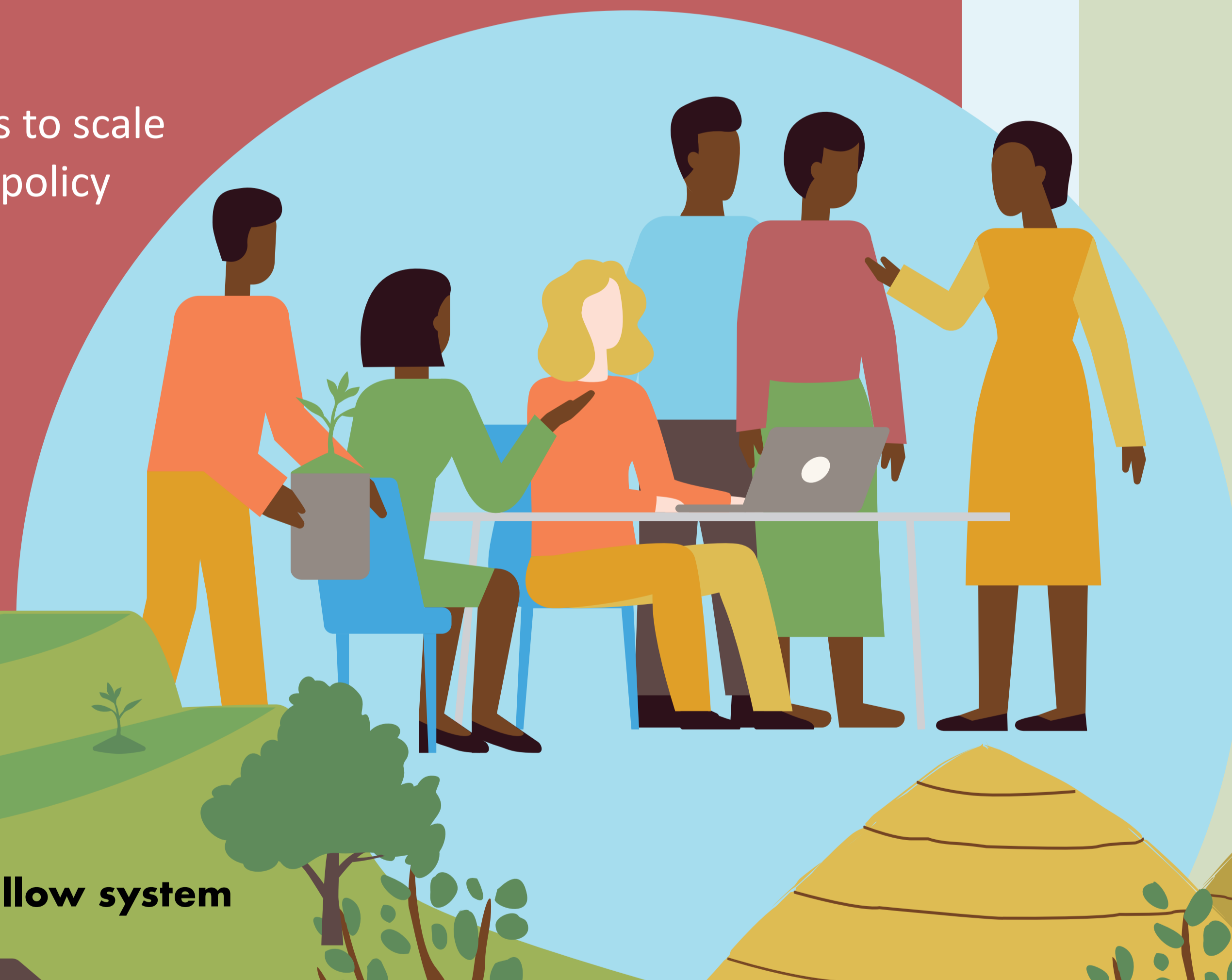
Improved fallow system